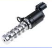
Oil Control Valve