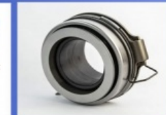
Clutch Release Bearing