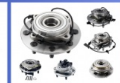
Wheel Hub Bearing