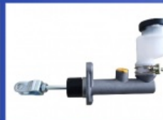
Clutch Master Cylinder