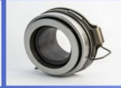
Clutch Release Bearing