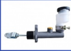
Clutch Master Cylinder