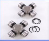
Universal Joint Bearing