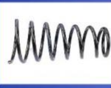
Shock Absorber Spring