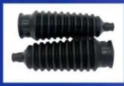
Steering Gear Boots