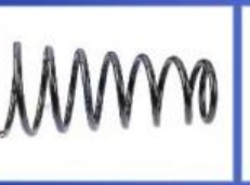
Shock Absorber Spring