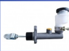
Clutch Master Cylinder