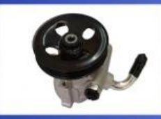
Power Steering Pump