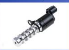
Oil Control Valve