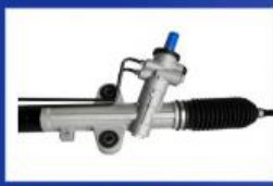
Power Steering Rack