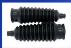
Steering Gear Boots