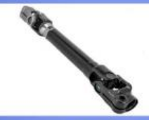
Steering Column Shaft