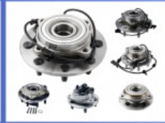
Wheel Hub Bearing